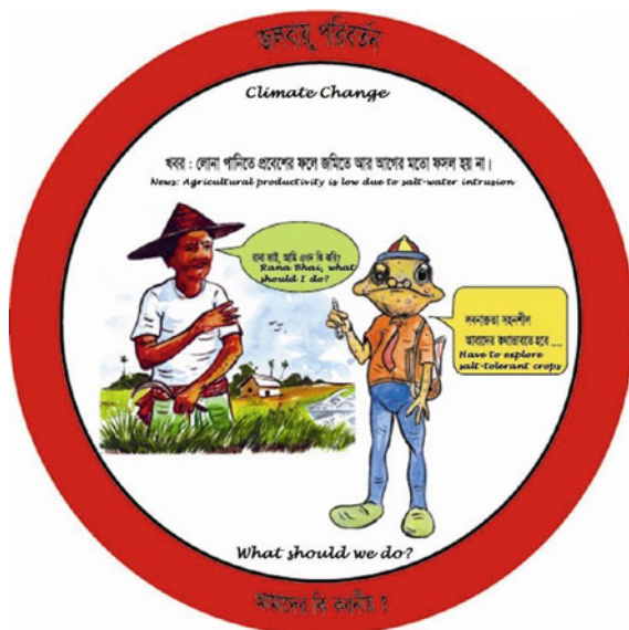
Fig. 16.2 Educational material showing Rana Bhai talking about climate change. Source IUCN (2010) (with authors' translations)

with a special focus on the children of 15 different schools and madrasa (religious school). The activities consist of essay and writing workshops, art camps, participatory drama, and distribution of awareness materials like posters and stickers and creation of a climate change mascot named “Rana Bhai”.